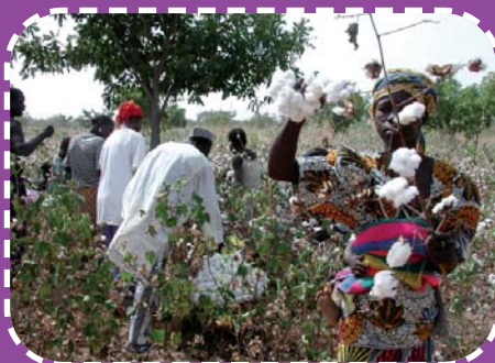
S.Ouattara © SYFHA International

The cotton is then sent to Morocco, a country in North Africa, in factories where it is woven, dyed and sewn to become a T-shirt.